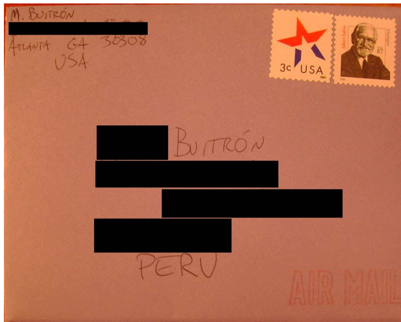
Figure 1. Examples of Envelopes Sent (To preserve confidentiality, addresses and first names are blocked)